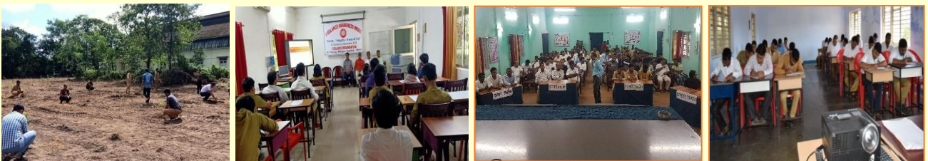
ACTIVITIES AT STC / NBQ